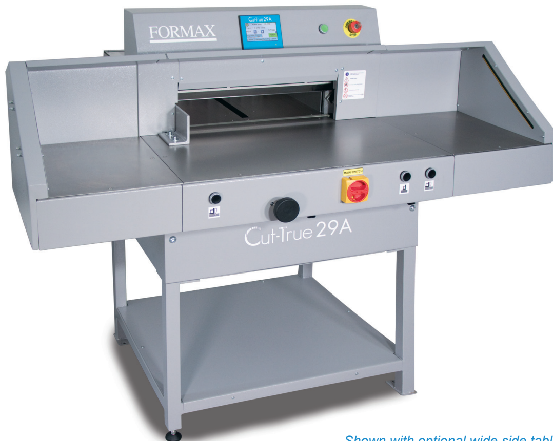
Shown with optional wide side tables

The Formax Cut-True 29A Electric Guillotine Paper Cutter offers precision cutting for paper stacks up to 20.5" wide. User-friendly, intuitive features include a touchscreen control panel, automatically-adjusting back gauge and the capacity to program up to 100 jobs/100 cuts . An infrared light beam safety curtain provides safety and convenience as it shuts down operation if the light plane is interrupted.